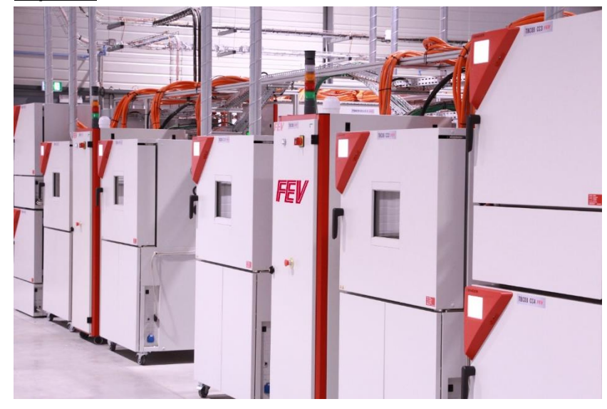
Battery test cells designed by FEV STS: cell testing case